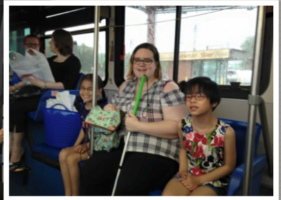
PARTICIPANTS, PARENTS, MENTORS AND TEACHERS RIDING THE CITY BUS TO THE MARY BRYANT HOME FOR THE BLIND.