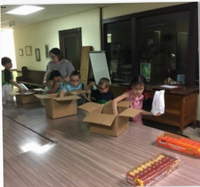
ASSEMBLING THE GIFT BAGS

reading braille, and do it so well! The participants also decorated and put together gift bags for all 36 residents. The smiles on everyone's faces made the trek through the rain worthwhile.