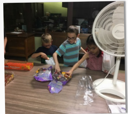
ASSEMBLING THE GIFT BAGS