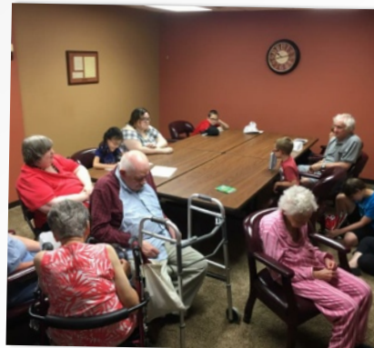
VISITING WITH THE RESIDENTS